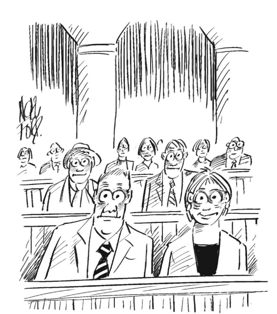
There was no more dozing off after the vicar started serving the extra-strength coffee before the service

For any further information please contact our President on 01959 524831.