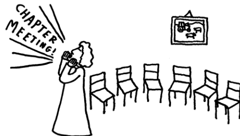
CALLING THE CLERGY TOGETHER FOR DEANERY CHAPTER MEETINGS

RURAL DEANS ARE IN CHARGE OF RURAL DEANERIES. THEIR DUTIES ARE AS FOLLOWS: