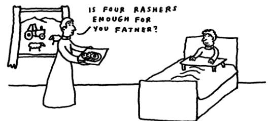
CARING FOR THE CLERGY OF THE DEANERY