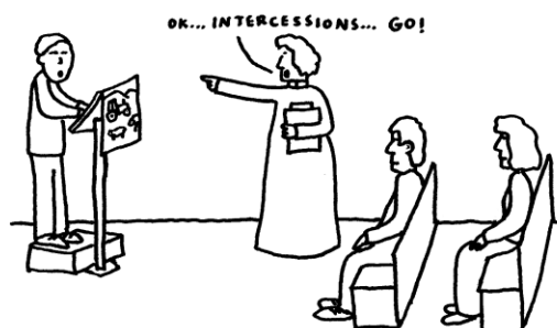
SUPERVISING THE PROVISION OF SUNDAY SERVICES DURING AN INTERREGNUM