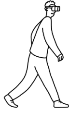
ARRIVING A BIT LATE